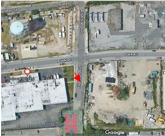
Borehole on Riverside Blvd south of Park Place