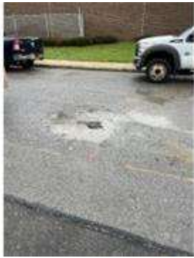
Borehole (existing condition)