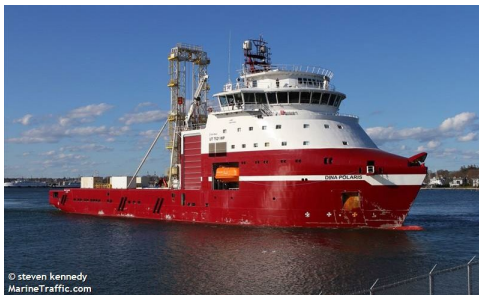
Name: Dina Polaris MMSI: 257006530 Call Sign: LAXB7