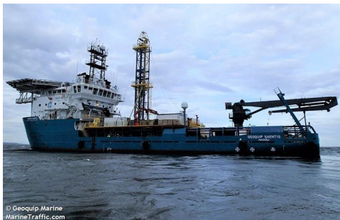
Name: Seantis MMSI: 311963000 Call Sign: C6UM8