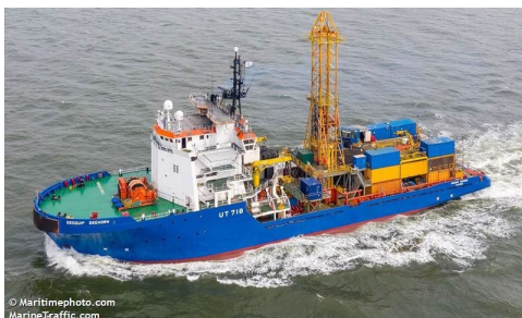
Name: Seehorn MMSI: 210204000 Call sign: 5BSW5

Geoequip vessels Dina Polaris , Seantis and Seehorn will be operating 24 hours/day to conduct geotechnical/soil boring site surveys to include subsea drilling. Survey activity is scheduled to be conducted thru August 31, 2021.