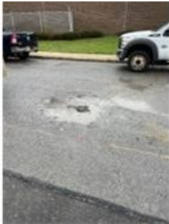
Borehole (existing condition)