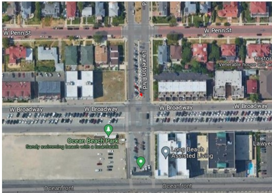
Borehole on Laurelton Blvd, north of West Broadway