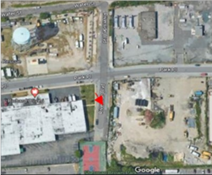
Borehole on Riverside Blvd south of Park Place