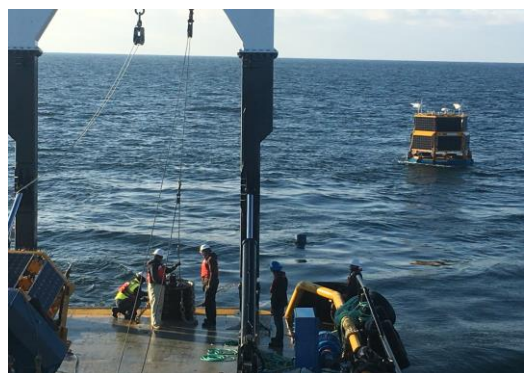
Floating LIDAR center of Empire Wind lease